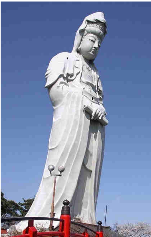
Statue of Kannon Byakue (Takasaki)

This illumination festival takes place on evenings from November to January and features several pavilions throughout the city.