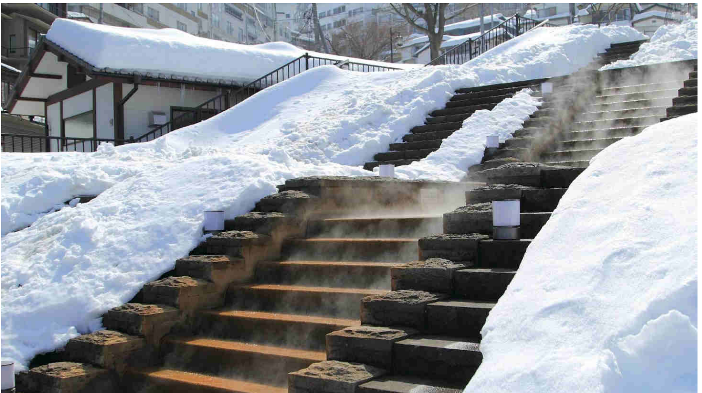
The 365 steps of Ikaho Onsen with hot spring flowing down the middle (Shibukawa)

The 365 stone steps symbolize prosperity for the spa town of Ikaho on every day of the year. They were built more than 400 years ago and were renovated in 1980.