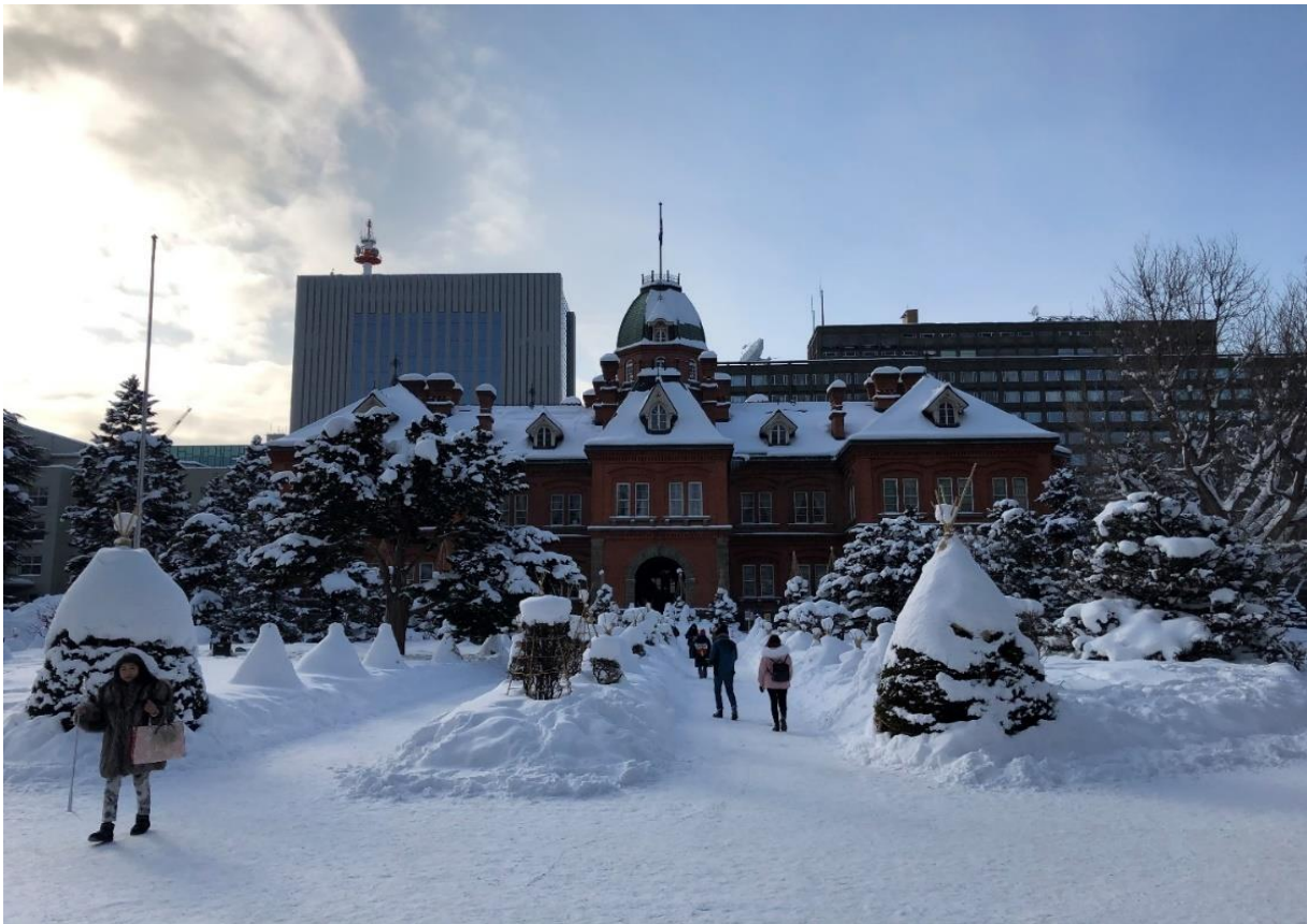
Former Hokkaido Prefecture Government Offices (Now Museum)

You can return to the main street of the Sapporo Snow Festival during the evening when the illumination takes place to be transported into a magical world of glowing ice.