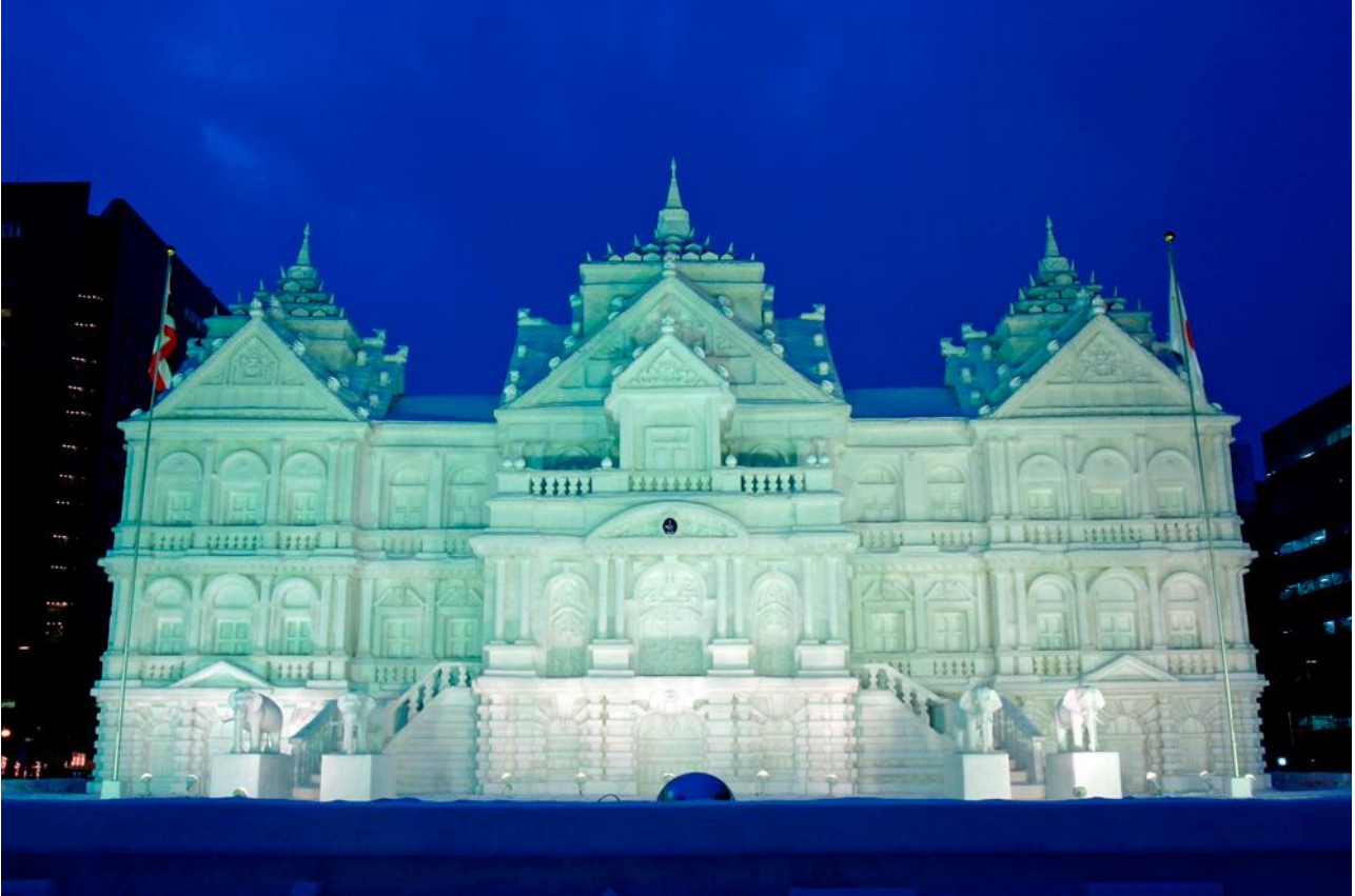
Snow carving at Sapporo festival

Using one of Sapporo's most abundant natural resources and their imaginations, a few students fashioned several snow sculptures in Odori Park in 1950. Today, the Sapporo Snow Festival is a winter show that attracts millions of people each year. While attending, you will experience Hokkaido hospitality, excellent food and drink, as well as amazing illuminations. The same goes for Asahikawa, which also has a truly impressive international artistic ice sculpture competition.