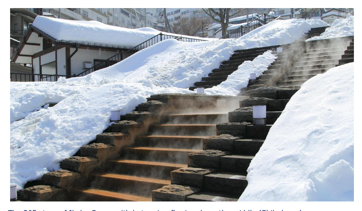
The 365 steps of Ikaho Onsen with hot spring flowing down the middle (Shibukawa)

• Walk up the 365 steps, visit some of the quaint shops and stalls during the evening. The 365 stone steps symbolize prosperity for the spa town of Ikaho on every day of the year. They were built more than 400 years ago and were renovated in 1980.