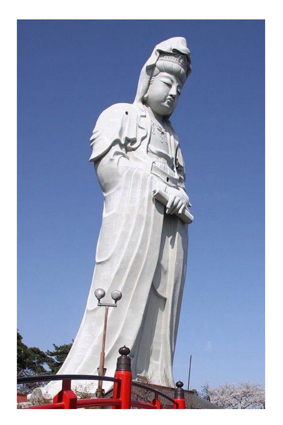
Statue of Kannon Byakue (Takasaki)