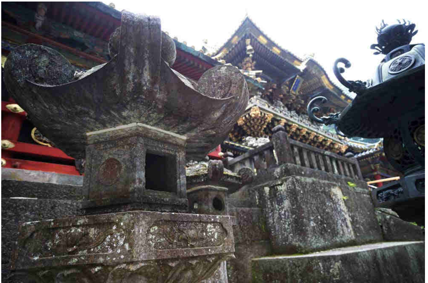
Toshogu Temple (Nikko)

Rinnoji is one of the three largest Buddhist temples founded by the Tendai School. The Sanbutsubo, the main hall, is classified as an "important cultural property" by the Japanese government. It is located in the Nikko National Park at the foot of Mount Nantai.