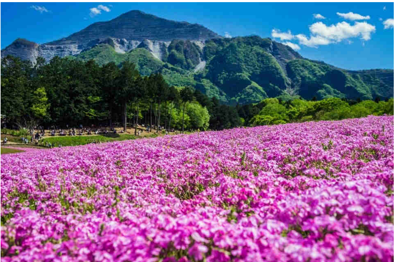
Hitsujiyama Park

Chichibu is a town in Saitama Prefecture known for its impressive landscapes and beautiful nature, including mountains that offer many hiking opportunities. Just 90 minutes by train from central Tokyo, Chichibu attracts many visitors who wish to escape the hustle and bustle of the metropolis.