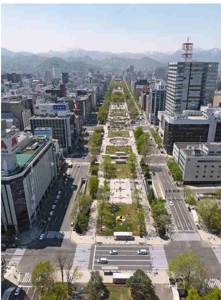
Odori Park (Sapporo)