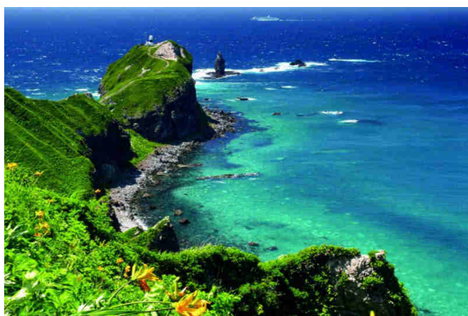
Cape of Kamui (Shakotan)

Visits and meals at your convenience, overnight at the hotel.