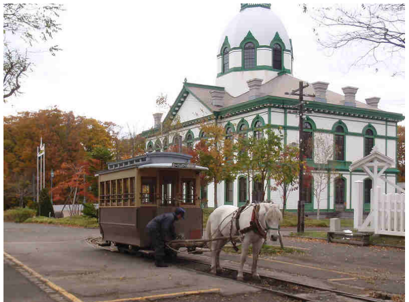
Kaitaku no Mura (Sapporo)