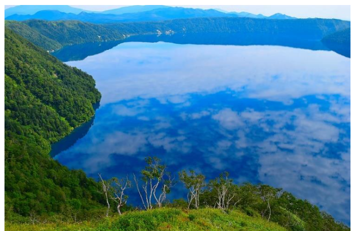
Lake Mashu (Teshikaga)