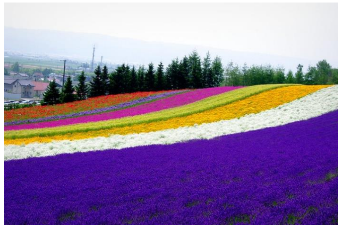
Tomita Farm (Furano)