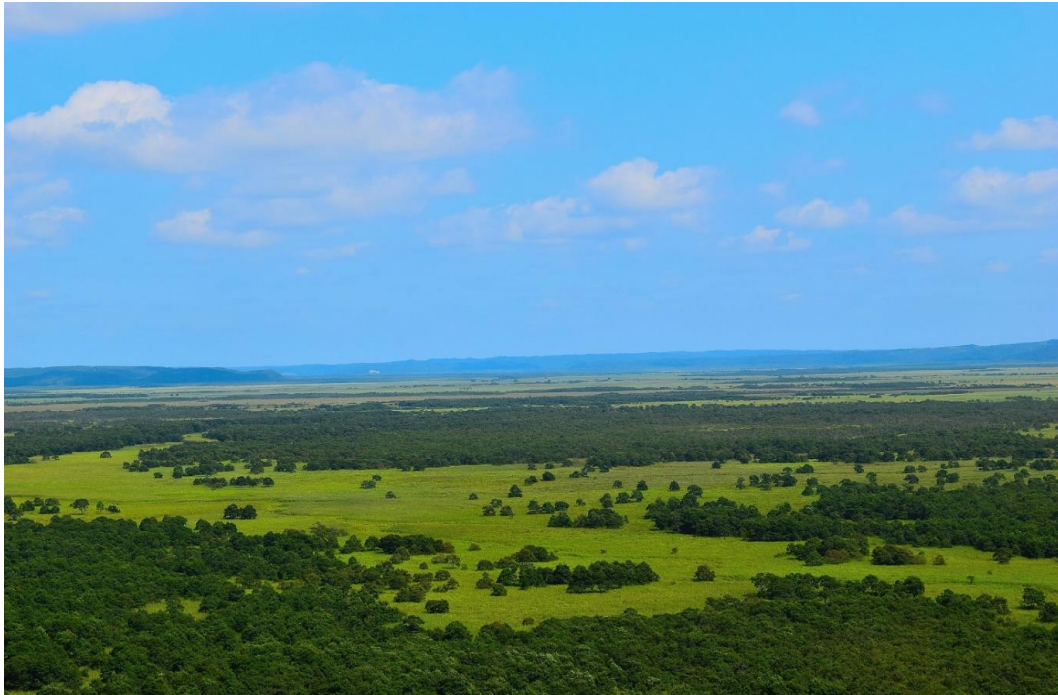
Kushiro Shitsugen (Kushiro)