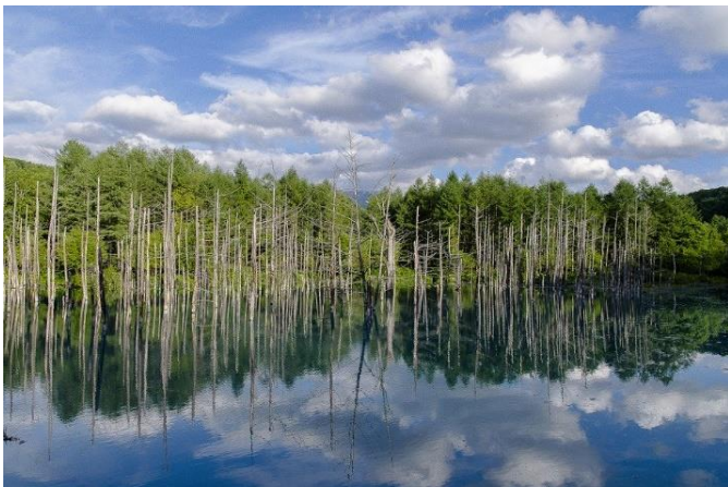
Aoi Ike (Biei)