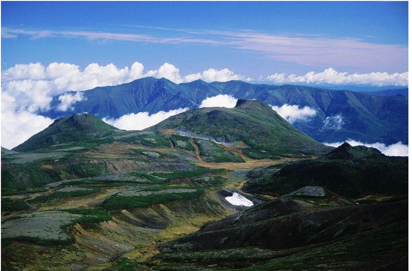
Mount Kurodake (Sounkyo)