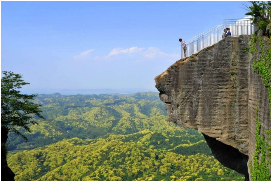
Ishikiriba Ato (Old Quarry)

Its well-maintained routes are recommended for beginner hikers. During the climb, you can see many attractions such as the "Ishikiriba ato" (old quarries) with their impressive vertical rock walls, the superb observatory at the top of the mountain called "Jigoku nozoki" (a look at hell) and the huge Nihonji Buddha, 31 meters high. You can make the descent by cable car.