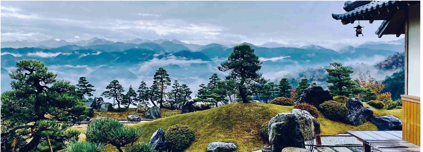
View from Sasayuri-ann (Nara)

Departure by private vehicle to Sasayuri-Ann from your hotel in Kyoto, visits and lunch at your convenience, Shabushabu or Sukiyaki dinner included. Overnight at Sasayuri-Ann. Check in from 3pm.