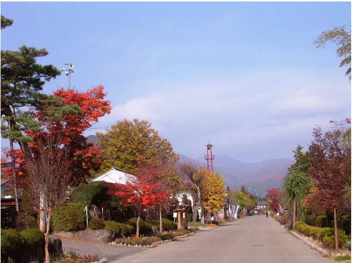
Oze Takumi no sato

Minakami Onsen is a hot spring located in Minakami city in the prefecture of Gunma and is one of the main hot springs of Gunma prefecture along with Kusatsu and Ikaho.