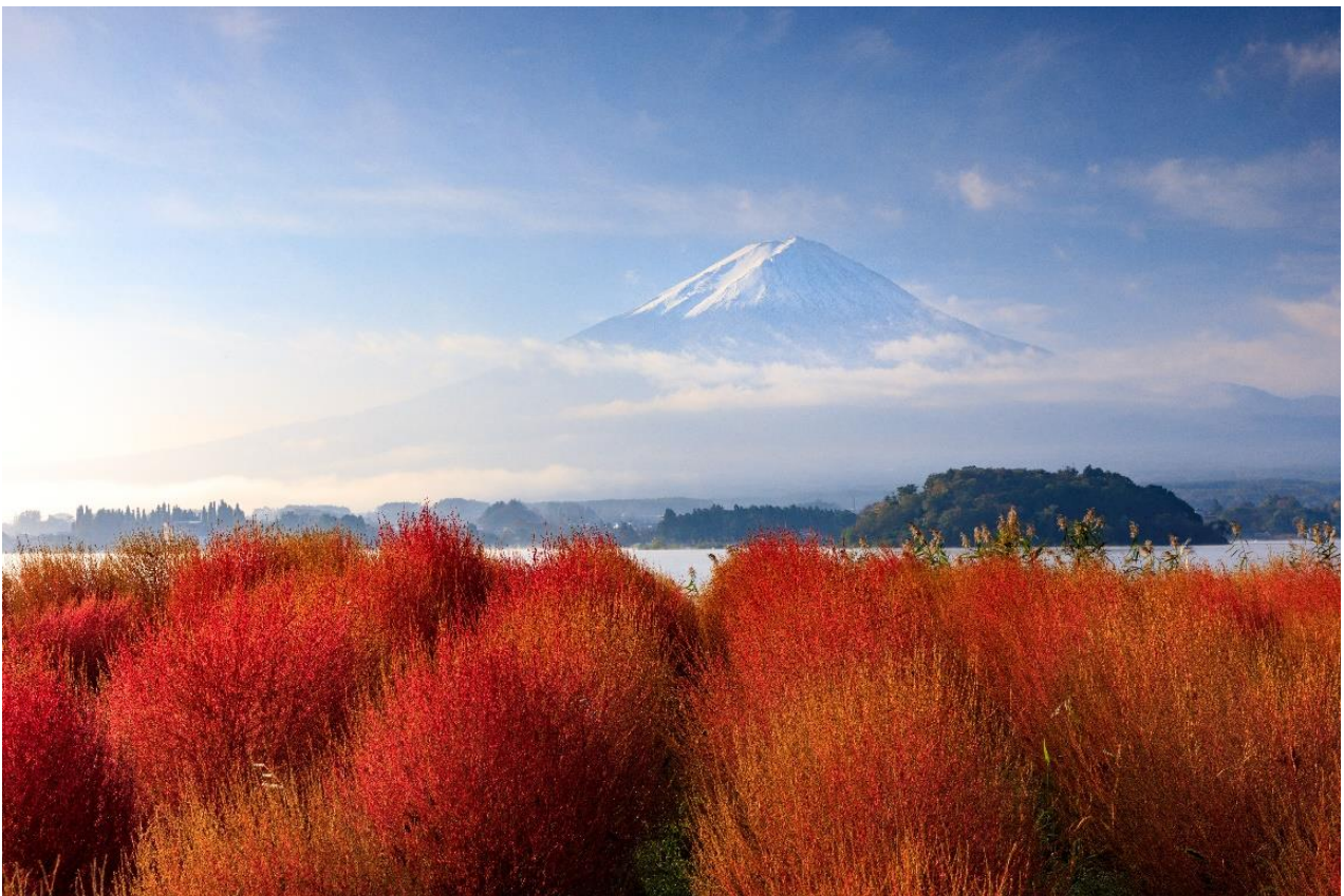
View on Mount Fuji

Plateau which culminates at 307m in the center of Shizuoka city. Nihondaira is famous for its fantastic views of Mount Fuji. The landscape in autumn is particularly beautiful.