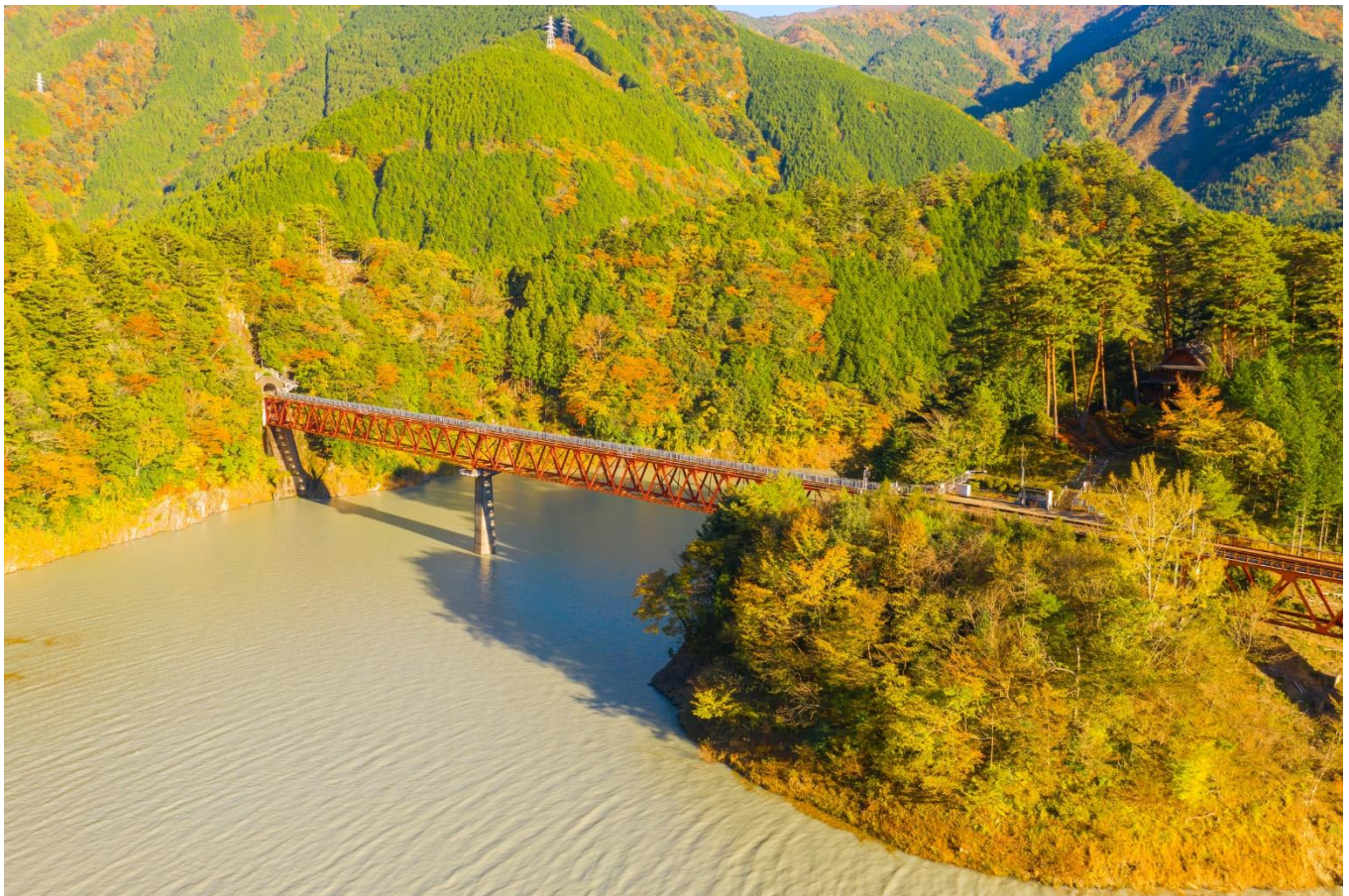
Oigawa Road (Shizuoka)

The Shizuoka area is very popular during autumn and is known to host 3 of the best landscapes in Japan at this time. Firstly, Shiraito Waterfall and Otodome Waterfall, both located in Fuji-Hakone-Izu National Park, offer a view of contrasting snow-covered Mount Fuji and the colorful leaves. Sumata Gorge is known for its famous "Dream Suspension Bridge" which offers an exceptional view of the beautiful Sumata River valley and its blue water.